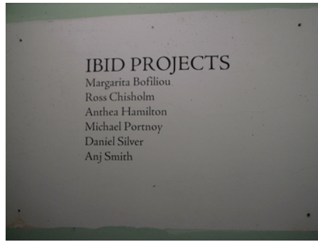
From London Vyner Street.