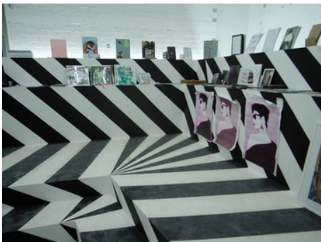
Community Approved, a pop-up store from NY. Athens is so chilled the store opens at 5pm.