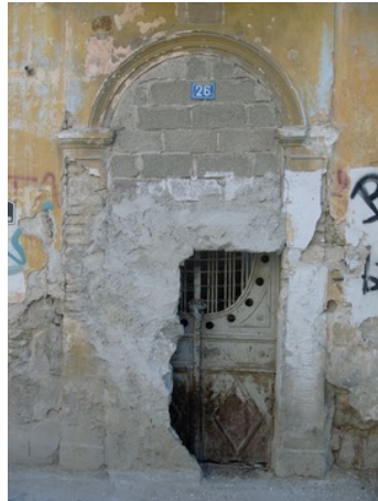
On Leonidou street was a building complex of galleries like: