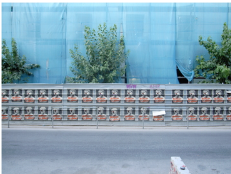
My favourite posters.